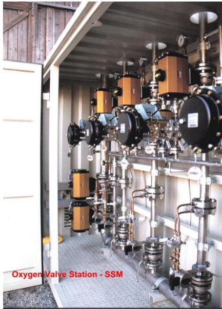
Oxygen Valve Station - SSM