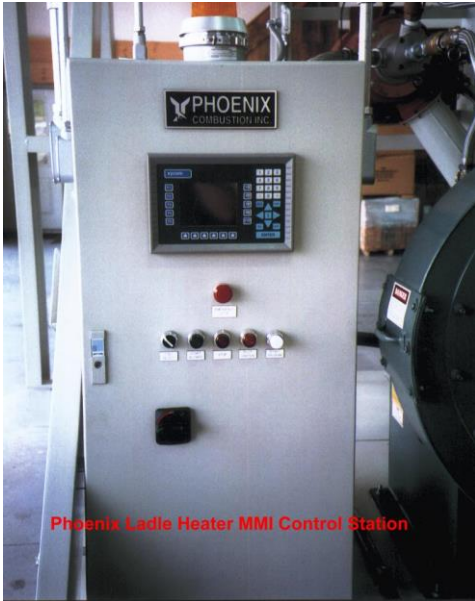
Phoenix Ladle Heater MMI Control Station